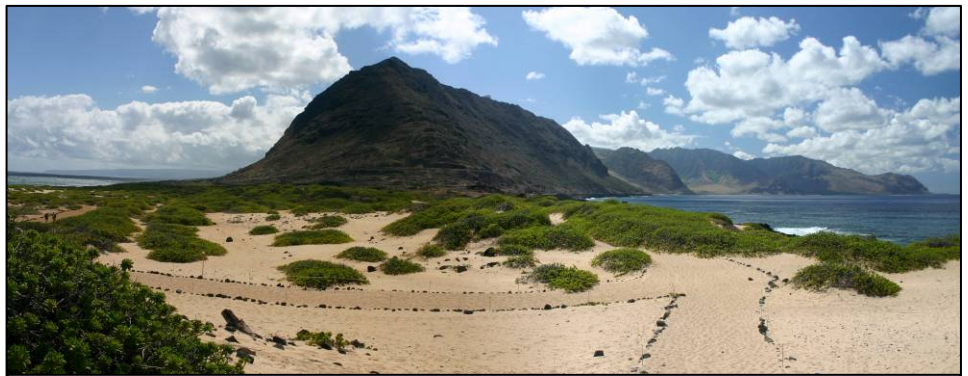
Ka'ena Point Natural Area Reserve, Hawai'i. Terrestrial systems are at risk from sea level rise, habitat loss, shifting habitat conditions, and expansion of invasive species and diseases.

4. Provide a forum for continuous exchange, feedback, and understanding among stakeholders, researchers, land managers, and communities. As a true