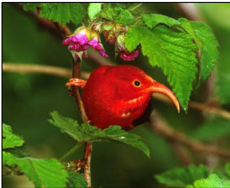
'Iwi, Hawai'i. Climate-related expansion of avian disease is a threat to forest birds.

2. Assess management options using models and historical data , and collectively determine priority conservation strategies. To make the link between modeling and management, the PICCC will assess the vulnerability of targeted species and ecosystems, and assist partners in choosing among potential management strategies based on their likelihood for success.