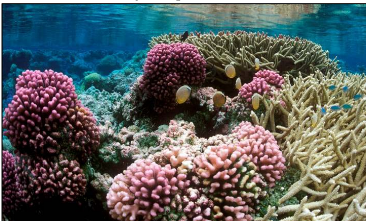
Palmyra Atoll, Pacific Remote Islands Marine National Monument. Ocean systems are at risk from rising temperatures, acidification, and sea level rise.